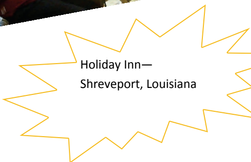
Holiday Inn— Shreveport, Louisiana