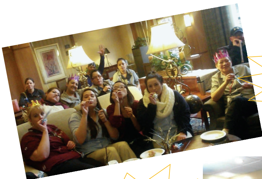
Staybridge Suites— Portland, Oregon