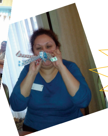
Country Inn & Suites— Portland, Oregon

Could you be the next Work Hard Live Free winner?