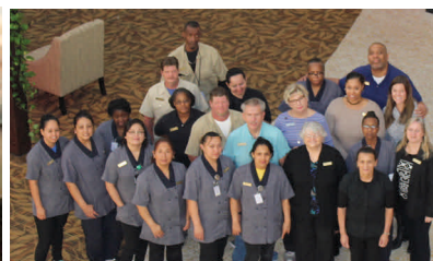
Embassy Suites Brunswick