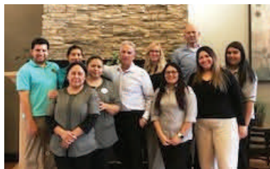
Homewood Suites La Quinta

YOU have the knowledge to help your hotel succeed. YOU can directly impact the revenue success for your hotel by sharing sales lead opportunities. Together we will all contribute to the Vesta Value : I am responsible for the revenue success of my hotel.