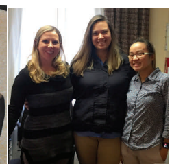
Staybridge Suites PDX